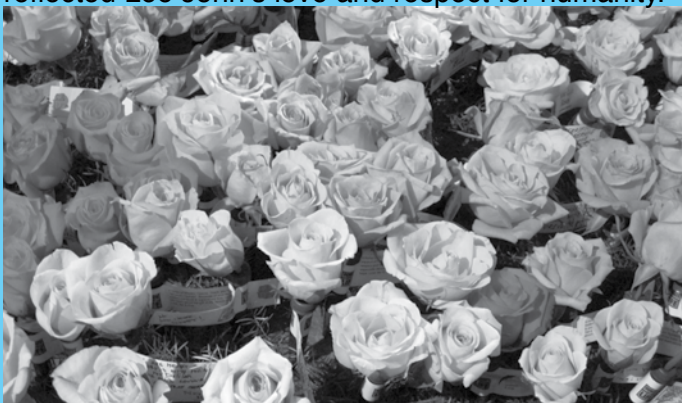
Roses dedicated by OMVs placed in the Family Circle Garden