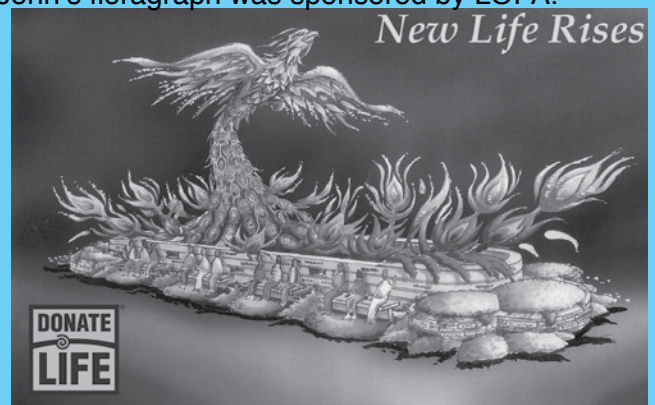
Artist's rendering of 2010 Rose Parade Float