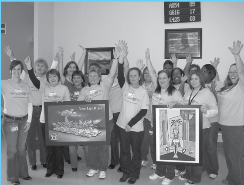
Rose Dedication ceremony at Lafayette's OMV

Louisiana is the only state in the nation whose OMV employees play such an active role in dedicating funds to help support the Donate Life Rose Parade Float that brings national attention to the importance of organ donation. This year, Louisiana's Office of Motor Vehicles dedicated 36 roses from 55 offices around the state. Both Heart Hospital of Lafayette and Opelousas General Health System participated by holding Rose Dedication Ceremonies. The Rose Parade is an excellent opportunity to connect local efforts to a nationwide initiative.