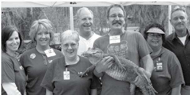
LOPA staff members at Alligator Bayou

There were many activities available including a wildlife exhibitor, face painting, crafts, gator feedings, story telling and much more.