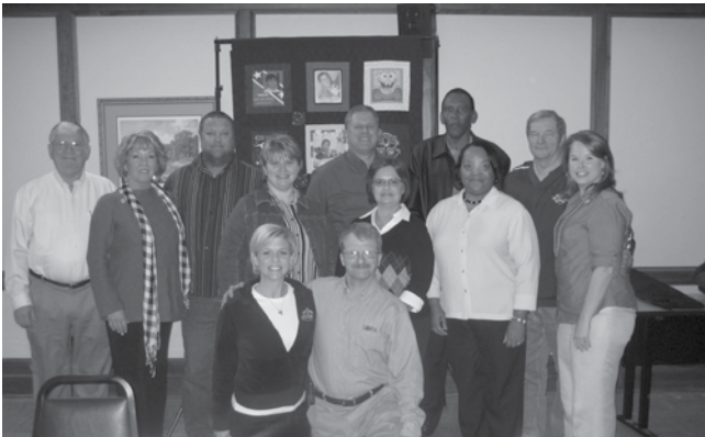
TSI Training in Lafayette

Those who attended the trainings received guidance on how to effectively communicate how donation and transplantation have affected their lives. Through their personal testimonies, many more Louisianans will be encouraged to register as organ and tissue donors.